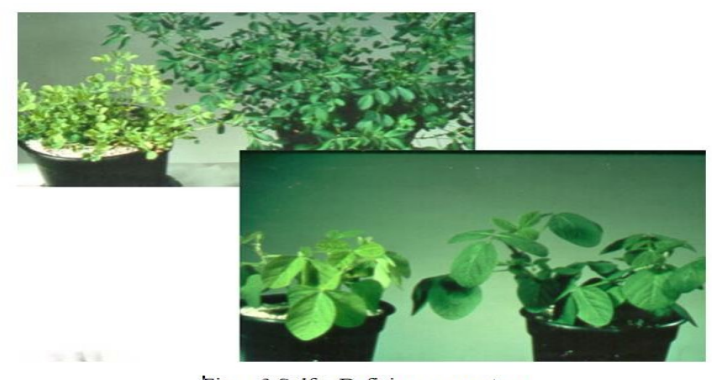
Figure 3. Sulfur Deficiency symptom Figure 3: Sulfur Deficiency Symptom.

Sulfur toxicity rarely occurs. Excess sulfate-S (SO4) can reduce the uptake of some anions such as nitrate (NO<sup>-</sup>3) and molybdate (MoO<sup>-</sup>4) (Khan Towhid Osman, 2013