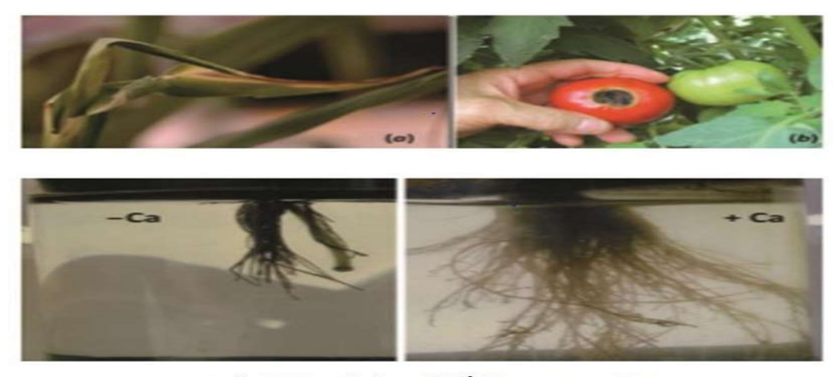
Figure 4: Calcium deficiency symptom Figure 4: Calcium Dificiency Symptom.